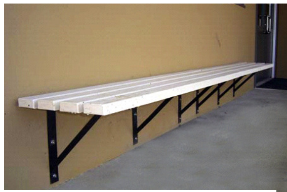
(Brackets in image are from outside source)